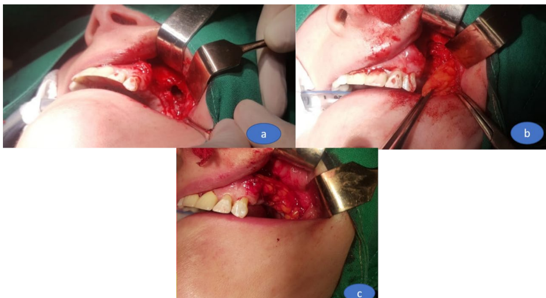
Figure 2: Intraoperative aspect of the oro-antral communication. Visualization and suture of the Bichat fat pad flap

prescribed and daily hygiene of the oral wound was performed. No local or general complications occurred and local healing was optimal without any inflammation or dehiscencies, with complete epithelization of the buccal fat pad flap.