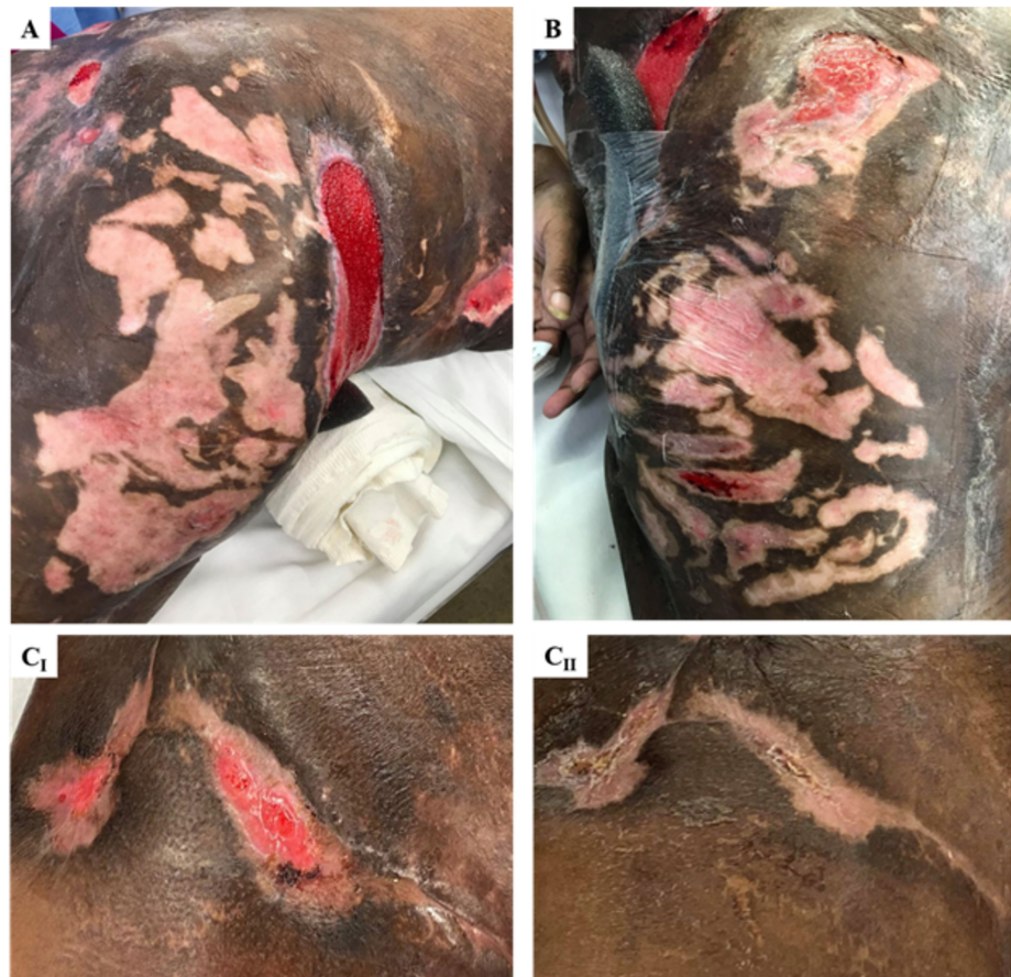
FIGURE 3: Calciphylaxis wounds healed by secondary intention

Posterior wounds recovered more rapidly in comparison to the anterior lesions, and the proliferation and maturation of granulation tissue were evident (Figure 3). Due to their delicacy, wounds containing granulation tissue were not vacuum sealed but covered by DuoDERM® (ConvaTec, OK, USA) instead. This approach provided a hydrous wound-healing environment for the newly formed tissue and increased rates of epithelialization. No evidence of eschar was observed following treatment, and as of date, the patient has not developed any novel complications.