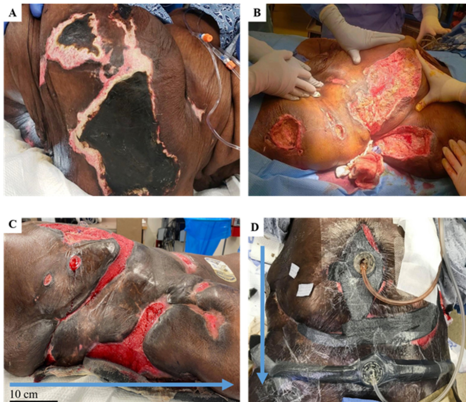
FIGURE 1: The initial presentation and improvement of wounds during the course of treatment

A) Ulcerated lesions demonstrated as black eschar were the initial presentation of wounds located on the buttocks, flanks, hips, thighs, and panniculus.