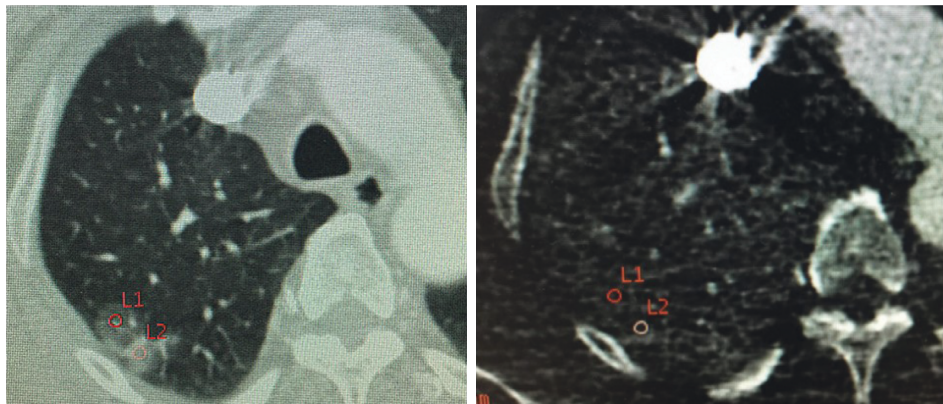
FIGURE 1: Female, 56 years old, adenocarcinoma in the right upper lobe. Schematic diagram of the ROI. Single-energy and iodine-based images showed the mGGN.

P < 0.05 was considered statistically significant.