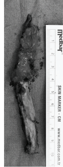
FIGURE 3: Photo of the excised mass.

The patient was placed in a supine position with a sand bag under the ipsilateral hip. The skin was incised starting from the anterior superior iliac spine and curving down so that it runs vertically for 8 cm, heading toward the lateral side of the patella (modified Smith-Petersen incision). The incision was deepened first between the sartorius and the tensor fasciae latae and then between the rectus femoris and the gluteus medius. We could then find the 10 cm long bony mass and carefully isolated it with minimal bleeding, osteotomized at the proximal end, stripped from the adherent soft tissue, and removed (Figure 3). Intraoperatively, we confirmed a full passive range of movement, achieved local homeostasis, and closed the incision over a suction drain. Because she