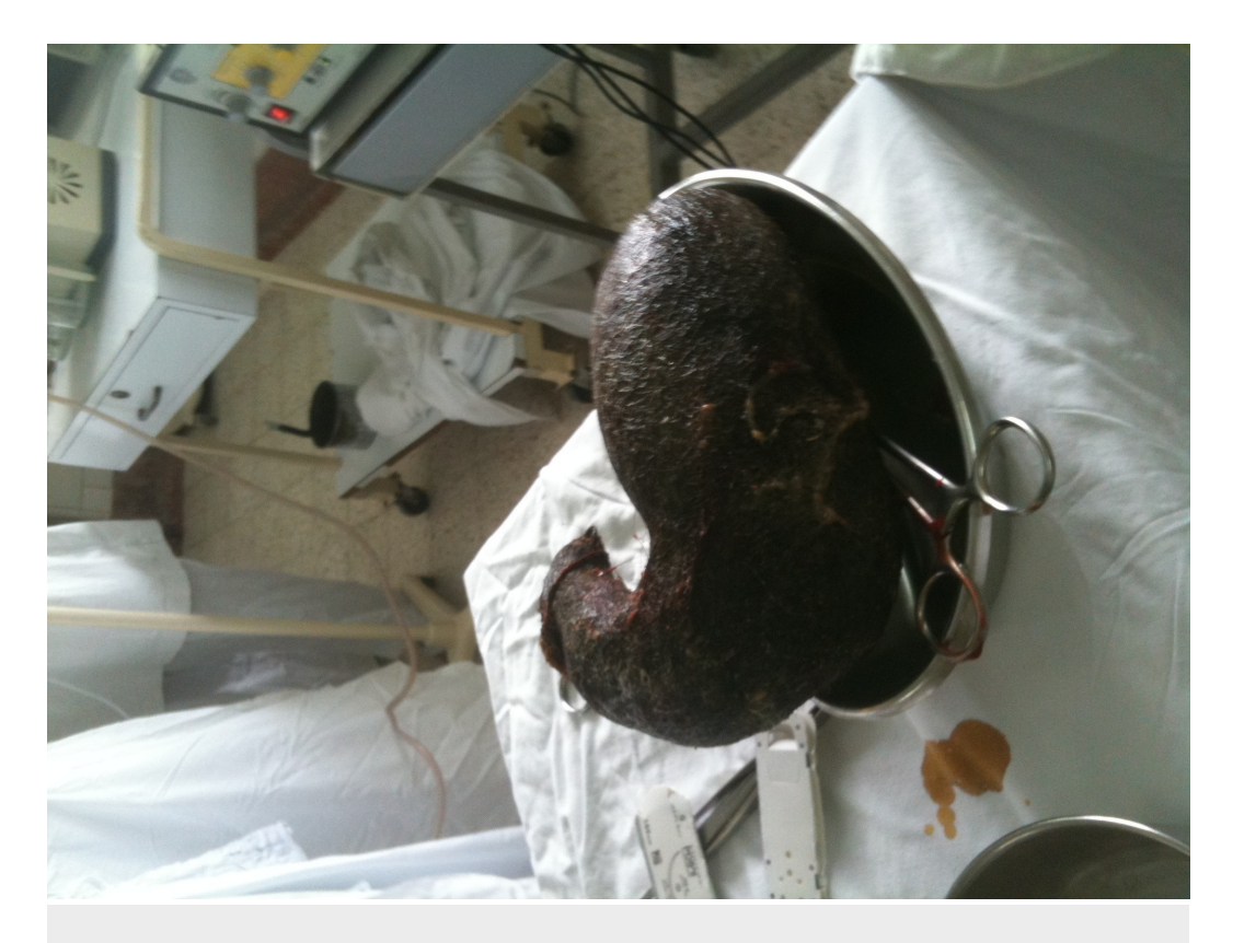
FIGURE 2: Gross view of removed trichobezoar.

small extension into the duodenum. At the time of removal, its weight was 1.2 kg (Figure 2). The stomach was sutured, and the abdomen and skin were closed in layers. With an unremarkable postoperative stay, the patient was discharged at the sixth postoperative day, with a follow-up visit scheduled in the surgery clinic.