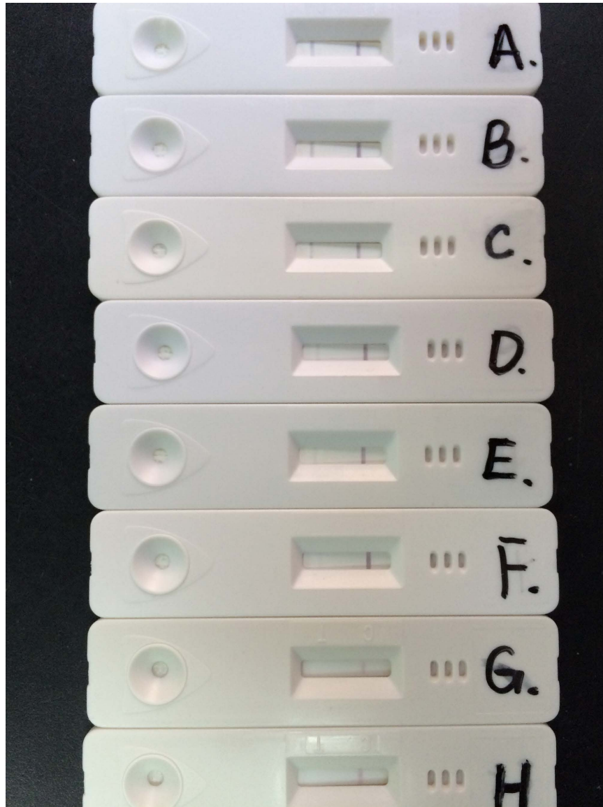
Figure 3. Sensitivity of the colloidal gold assay. (A) 10^7 copies/ml; (B) 10^6 copies/ml; (C) 10^5 copies/ml; (D) 10^4 copies/ml; (E) 10^3 copies/ml; (F) 10^2 copies/ml; (G) 10^1 copies/ml; (H) Negative control.