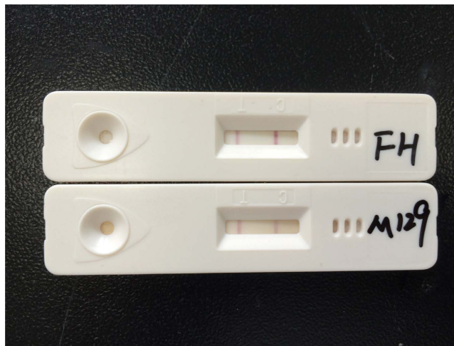
Figure 2. FH and M129 test results in the colloidal gold assay.

both FH (type II M. pneumoniae ) and M129 (type I M. pneumoniae ) strain were positive in the colloidal gold assay (Fig. 2).