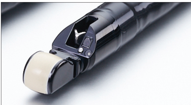
Figure 1. New therapeutic EUS scope with large working channel (4.0 mm)

The Fujinon corporation has also developed a therapeutic EUS scope. The EG-580UT, an ultrasound endoscope with Forceps Elevator Assist which enables