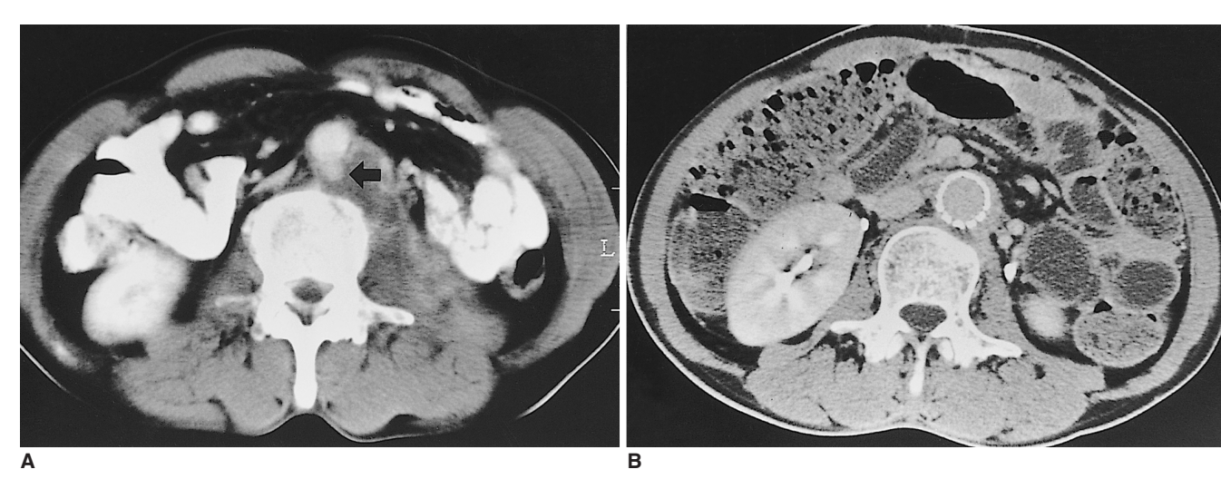
Fig. 2. A 41-year-old man with rupture of aortic aneurysm during surgery for drainage of psoas abscess. A. Pre-operative enhanced CT shows psoas abscess with a small aneurysm of the aorta (arrow). B. Three months after stent graft deployment, the myocotic aneurysm was occluded and the psoas abscess had completely healed.

To our knowledge, our reports are the first to describe the non-surgical treatment of tuberculous aortic aneurysm