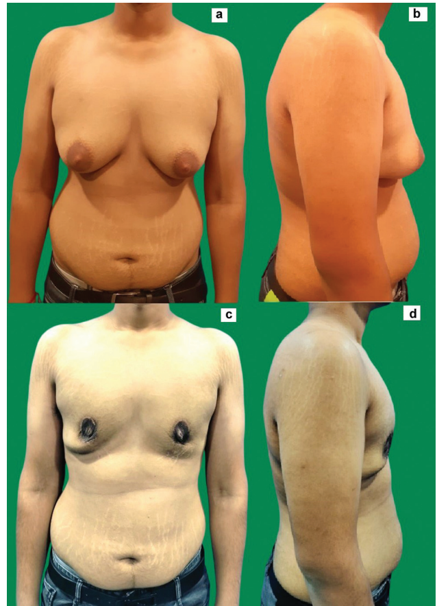
Fig. 5 (a,b) Preoperative and (c,d) postoperative photographs of a patient with grade 4b gynecomastia. Skin has contracted significantly but loose skin around the inframammary fold (IMF) persists.

Skin contraction is usually known to occur over a period of 6 months to even 1 year after liposuction. 9,12 VASER liposuction is known to preserve elastic connective tissue and dermis, leading to skin retraction. 9 The larger the volume of liposuction, the longer the time taken for skin retraction. 13 Due to this, the authors believe that a second stage to excise extra skin should be planned at least 6 to 9 months later. Similar view is held by other surgeons as well. 14 Mett et al did liposuction and gland removal for grade 2b gynecomastia where they noted that skin contracts in 3 months. However, for the largest grades they continued to do reduction with inferior pedicle and horizontal scars across the chest. 4 Abdelwahab et al also measured skin retraction at 3 months postsurgery in grade 3 gynecomastia and found significant skin retraction and repositioning of the NAC. 15 Ramasamy et al measured the amount of skin contraction after liposuction and gland excision objectively. 16 The measurements were done preoperatively and at 6 months postoperatively. Significant retraction of skin, elevation of the NAC, and reduction in area of the NAC were seen in all grades of gynecomastia, with maximum changes in severe grades of gynecomastia. However, the study does not mention residual skin laxity and other outcome parameters for grade 4 gynecomastia patients.