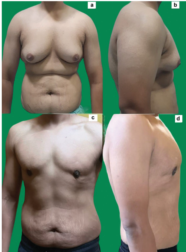
Fig. 4 (a,b) Preoperative and (c,d) postoperative photographs of a patient with grade 4b gynecomastia. Please note the excellent retraction of skin, especially after his weight loss and fitness journey.

lose weight. 11 However, all our patients were very much concerned about a femalelike chest and postsurgical scars and their minimization.