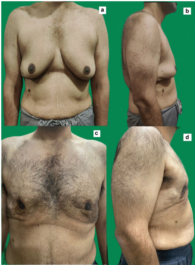
Fig. 6 (a,b) Preoperative and (c,d) postoperative photographs of a patient after massive weight loss with grade 4b gynecomastia. Although skin was thin with poor quality and large number of stretch marks, skin retraction was achieved to near absence of loose skin and disappearance of the inframammary fold (IMF).

through the axillary incision and no infection caused by drains was noted by us in our series. The patients remained comfortable and no analgesics needed to be added beyond those administered to patients who did not have a drain (grade 4a). It has been noted by the authors that even early removal of the drain leads to increased incidence of seroma. The purpose of drain insertion by us is not to prevent hematomas. Although some studies suggest that drains do not have any added advantage in a gynecomastia surgery, they either have a lower grade of gynecomastia or a very small number of cases. 20,21