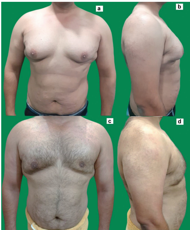
Fig. 2 (a,b) Preoperative and (c,d) postoperative photographs of a patient with grade 4a gynecomastia. Although the skin has retracted greatly, there still is some amount of skin excess.