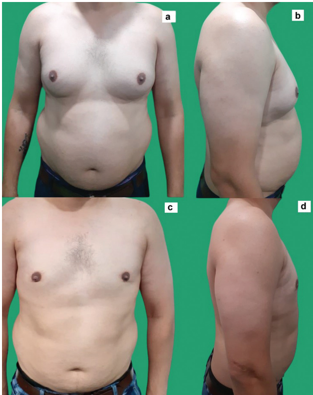
Fig. 1 (a,b) Preoperative and (c,d) postoperative photographs of a patient with grade 4a gynecomastia. The skin has retracted completely and the inframammary fold (IMF) is obliterated.