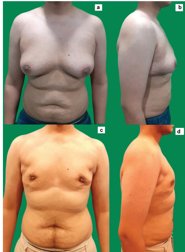
Fig. 3 (a,b) Preoperative and (c,d) postoperative photographs of a patient with grade 4b gynecomastia. He has a very good quality skin, which has retracted completely. Scars of the nipple-areola complex (NAC) lift are barely visible.

of gland through an infra-areolar incision allows a minimally invasive approach to the chest causing least visible scars with an excellent result in the lower grades. However, it is not universally accepted as the procedure of choice for severest grades of gynecomastia. To the best of our knowledge, there is no study in the literature that discusses the long-term outcomes of treatment of grade 4 gynecomastia. Although we used the Gupta and Punia classification for its objectivity, these cases are similar to Rohrich's grade 4 gynecomastia and the readers may use either of them.