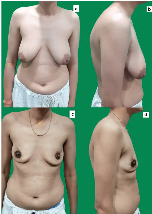
Fig. 8 (a,b) Preoperative photographs of a patient with grade 4b gynecomastia with very severe ptosis. (c,d) Postoperative photographs after the second stage of peri-areolar skin excision. Minimal scars are seen and the patient is satisfied.