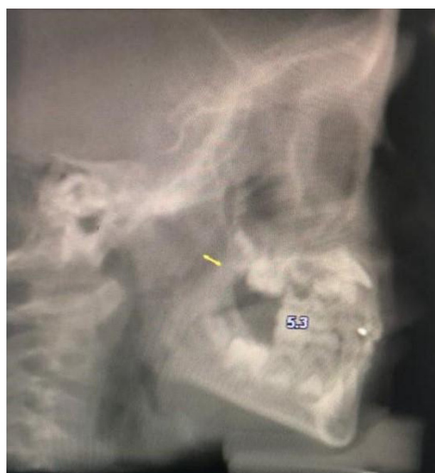
Figure 4. Measurement of PNS-AD1 distance.

BaSN angle was significantly lower in the OSA group, consistent with studies that showed a positive correlation