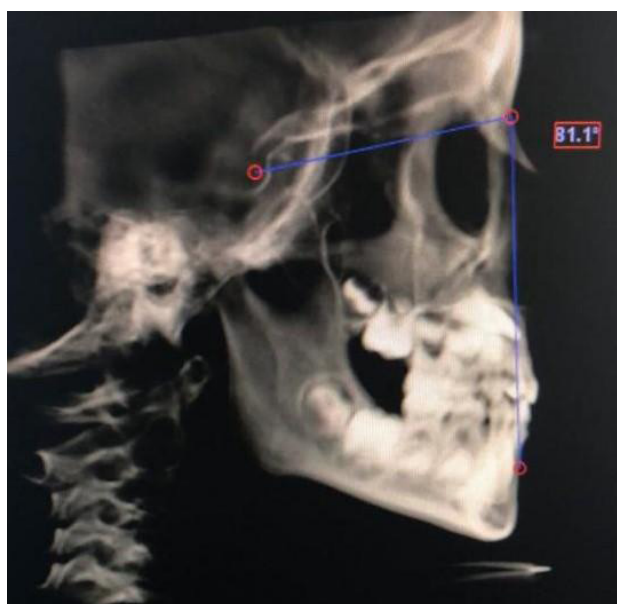
Figure 3. Measurement of SNB angle.

with the current study results. However, these findings were not statistically significant in our study, which might be related to different ethnic groups compared to our study. Also, in Buchanan and colleagues' study, UA was longer in the OSA group, which contrasts our results. The reason might be the use of different points for defining UA length (hard palate to epiglottis) compared to our study. However, a study by Neelapu et al 23 was consistent with our study regarding longer UA in OSA patients due to lower hyoid position.