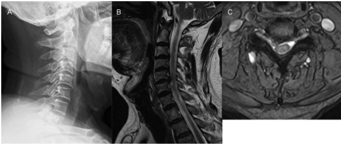
Fig. 1 Preoperative images of the cervical spine: (A) X-rays, (B) sagittal magnetic resonance imaging (MRI), and (C) axial MRI at the C5/6 level.

observed when he was allowed to drink water and eat porridge.