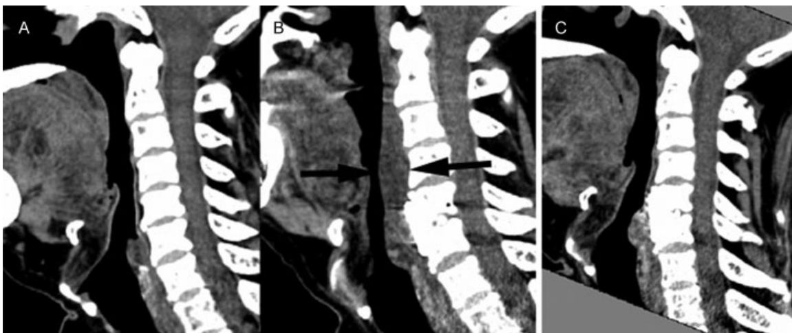
Fig. 2 Sagittal reconstruction of cervical computed tomography images: (A) before, (B) 2 days, and (C) 2 months after the surgery. The middle pharyngeal space was reduced after the anterior cervical discectomy and fusion, leaving a thickened posterior pharyngeal wall and prevertebral soft tissues (between the black arrows in B). The stenosis was improved at follow-up.

Anterior cervical fusion is often used to treat patients with radiculopathy and myelopathy after the failure of nonoperative treatment. In the two reports on upper airway obstruction after anterior cervical fusion in English, the metal plate used for the cervical fusion was the cause of the upper airway