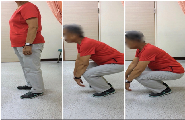
Figure 2: Patient presented in Figure 1, six months after revision surgery. She is able to stand upright with full weight bearing and to do full squat at that time

de Vries et al. treated 33 cases of subtrochanteric nonunion in 32 patients with blade plates and the selective use of bone grafts; eventual union was observed in 32 cases, with an average time to union of 5 months. 24 These researchers suggested that alignment correction and fracture site compression are more feasible with plating than nailing. Nine of the 32 patients experienced a complication after the index operation; the observed complications included blade tip protrusion and implant breakage. Due to these complications, five patients required reintervention. In contrast, in our study, no patient underwent a secondary intervention, and no major complications were observed. Haidukewych and Berry reported a similar union rate between extramedullary plating and intramedullary nailing. 25 In their series, 21 subtrochanteric fracture nonunions were treated with open reduction and internal fixation with a cephalomedullary nail, a standard antegrade interlocking nail, 95° blade plate, or sliding hip screws. Twenty of the 21 cases of nonunion healed and there was no difference between using intramedullary or extramedullary device. No details regarding union time or secondary interventions were discussed.