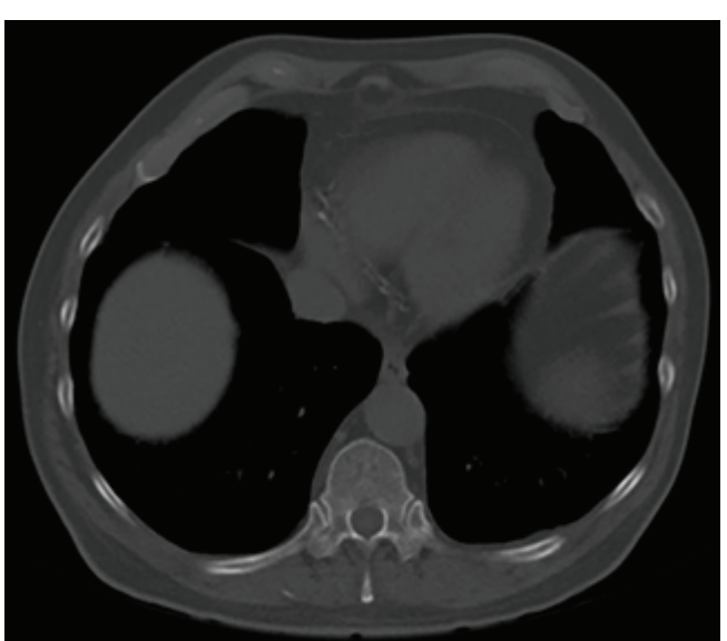
Figure 1. CT scan (bone window) of abdomen performed 4 months prior to admission showing metal wire fragment foreign body in the right erector spinae.

The staging CT was reported to be consistent with a primary bronchogenic carcinoma in the middle lobe of the right lung, classified as T2aN1M1b (Figure 2). The L1 vertebra was noted to have collapsed, with expansile lytic lesions extending into the left pedicle and transverse process (Figure 3). The surrounding soft tissue filled the nerve root exit foramina and encroached into the bony spinal canal. There were further multiple lytic lesions in the L4 vertebral body, left pedicle of the L5 vertebra, left sacral alum and right periacetabular region. On retrospective review of the CT performed 5 months ago, a lytic lesion was seen in the left posterior aspect of the L1 vertebra, extending into the spinal canal (Figure 4).