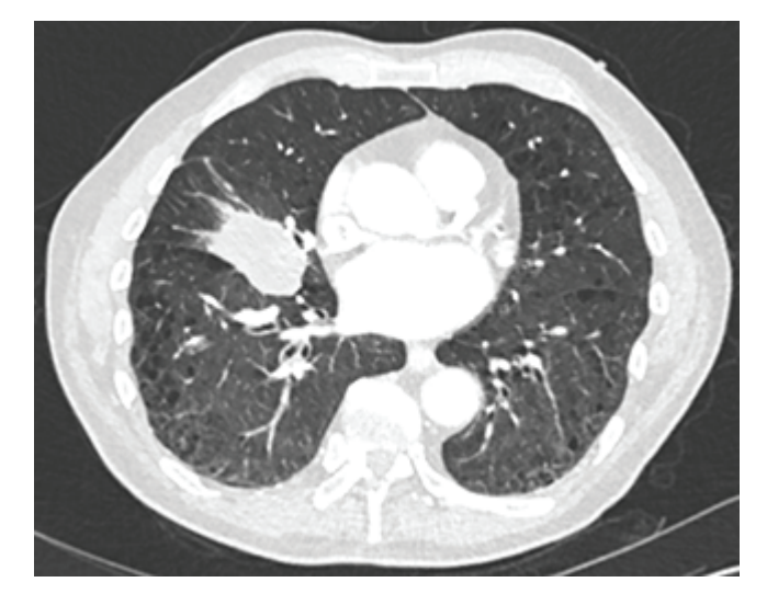
Figure 2. CT scan (lung window) of chest performed during admission showing a speculated soft tissue mass in the right middle lobe consistent with a primary bronchogenic carcinoma.

The staging CT was reported to be consistent with a primary bronchogenic carcinoma in the middle lobe of the right lung, classified as T2aN1M1b (Figure 2). The L1 vertebra was noted to have collapsed, with expansile lytic lesions extending into the left pedicle and transverse process (Figure 3). The surrounding soft tissue filled the nerve root exit foramina and encroached into the bony spinal canal. There were further multiple lytic lesions in the L4 vertebral body, left pedicle of the L5 vertebra, left sacral alum and right periacetabular region. On retrospective review of the CT performed 5 months ago, a lytic lesion was seen in the left posterior aspect of the L1 vertebra, extending into the spinal canal (Figure 4).