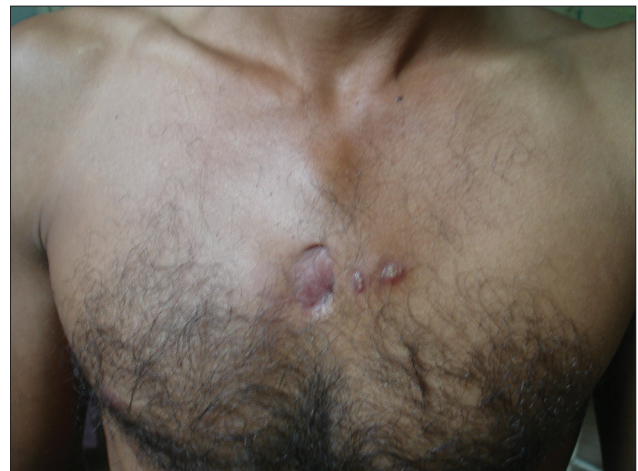
Figure 1: Young male with multiple cutaneous sinus and fistula over upper part of sternum

two hypoechoic linear tracts communicating with skin; pus aspirate was positive for acid fast bacilli on Ziehl-Neelsen staining; Contrast enhanced computed tomography (CECT) of the thorax [Figures 2 and 3] showed peripherally enhancing hypodense collection seen in the subcutaneous plane with underlying irregularity of body of sternum-carries of sternum with few calcified lymph node noticed in paratracheal region; underlying lung parenchyma appeared normal. Patient was counseled and started on anti-tubercular therapy under directly observed therapy short course (DOTS) of alternate day regime prescribed under Revised National Tuberculosis Control Program, i.e., isoniazid (600 mg), rifampicin (450 mg), pyrazinamide (1500 mg) and ethambutol (1200 mg). The patient is under follow up and has improved clinically with afebrile status, weight gain, resolution of pus and healing of sinuses. It is planned to administer intermittent therapy under DOTS for 9 months.