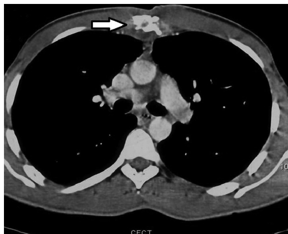
Figure 2: CECT thorax showing caries sternum (cross-sectional view)