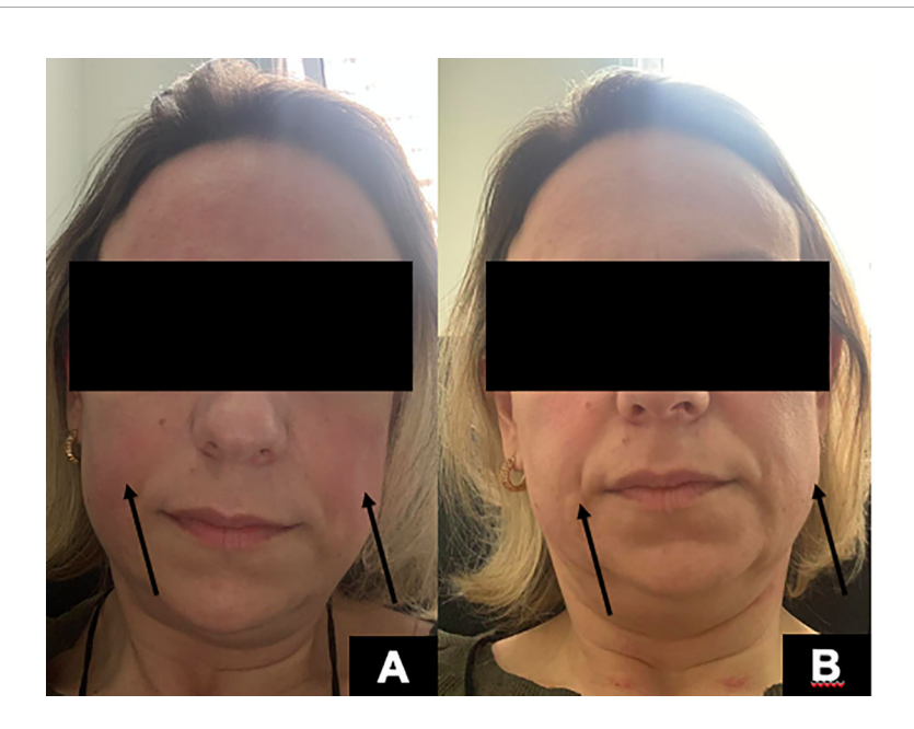
FIGURE 2 | (A) Facial erythema and flushing (arrows) during Ocrelizumab infusion. (B) Facial angioedema (arrows) minutes after the initial facial erythema.