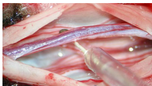
Fig. 2 Direct stimulation of a terminal filum with a monopolar probe. During surgery, direct spinal stimulation was performed in order to objectively discriminate between nerve roots and non-nervous tissue like the terminal filum. With a threshold of at least three times the threshold of an identified nerve root, non-nervous tissue was dissected

No muscle relaxants were given during surgery because of the negative effect on muscle responses. Short working muscular-blocking agents were only given during intubation. All patients received opiates for sedation (sufentanil or remifentanil). The first eight to ten patients of this series received sevoflurane as halogenated agent. As this inter-