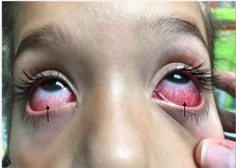
FIGURE 1: Bilateral subconjunctival hemorrhage with limbar sparing at initial presentation.

fever despite antibiotic and antipyretic treatment, oral mucositis, and strawberry tongue, and the girl was referred to our center for specialized management and treatment. Upon direct admission to our pediatric infectious disease ward, temperature was 38.8°C, heart rate 118/min, blood pressure 113/73 (mean arterial pressure [MAP] 86) mmHg, pulse oximetry 94% O 2 saturation. Non-suppurative bilateral conjunctivitis with limbar sparing (Figure 1) was documented, strawberry tongue, and right-side non-tender cervical lymphadenopathy, and looked acutely ill. Laboratory findings showed complete blood count hemoglobin 12.7 g/dL, hematocrit 34.8%, 6770 leukocytes/mm 3 (neutrophils 2300, 2480 lymphocytes, 30 eosinophils), and 285,000 platelets/mm 3 . C-reactive protein (CPR) was 59 mg/dL (normal range <20 mg/dL), and biochemistry tests were normal. No sterile pyuria was documented. Intravenous immunoglobulin (IVIG) at 2 g/Kg on single infusion, and oral acetylsalicylic acid (ASA) at 80 mg/kg/d were initiated. The patient evolved satisfactorily with fever resolution over the next 24 hours.