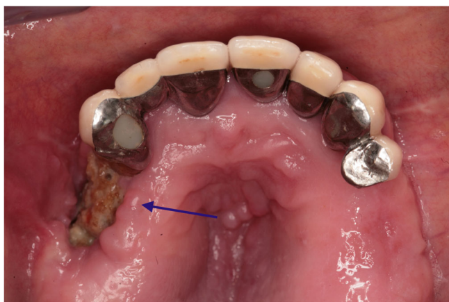
FIGURE 2 Location: Upper Jaw. Zoledronic acid for more than 3 years. Bone exposure

antibiotic with amoxicillin + clavulanic acid (875 mg + 125 mg) and metronidazole (500 mg) three times per day and antiseptic therapies. During the observation period, bone exposure slightly reduced and it was found to be present in 33.3% of the sample at t_4 . Differences in terms of bone exposure at different time-points were found to be not statistically significant ( p = .544 ); furthermore one patient expelled the bone sequestrum spontaneously.