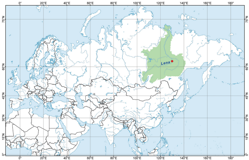
Figure 1. Map of Lena River basin, Eastern Siberia, with occurrence of the leech-bryozoan association in a floodplain lake (red dot).