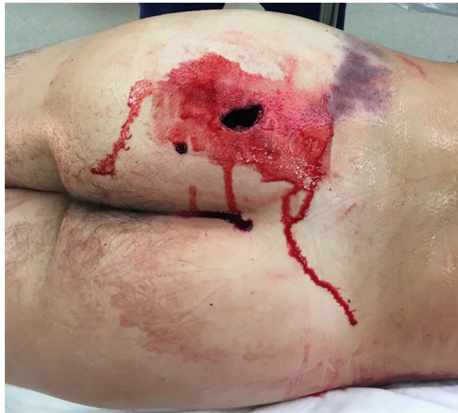
Fig. 2. Traumatic wound in ED.

The patient was taken to theatre within 24 h of injury, where he was positioned semi prone on a radiolucent table.