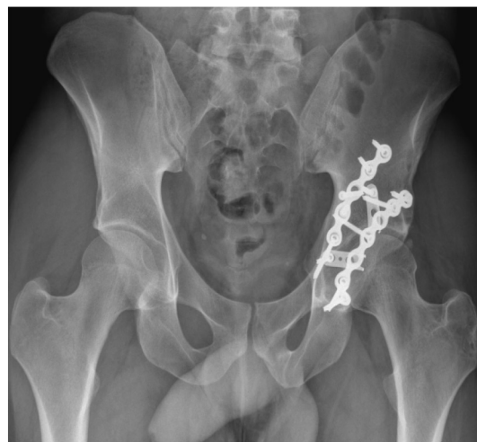
Fig. 4. Post op surgical wound at 2 weeks and AP Pelvic XR at 6 weeks.