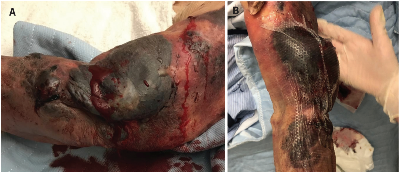
Figure 1: Photographs of bullous hemorrhagic dermatosis lesions on the left arm and hand of a 90-year-old woman, on day 6 (A) and day 10 (B) of fondaparinux administration.