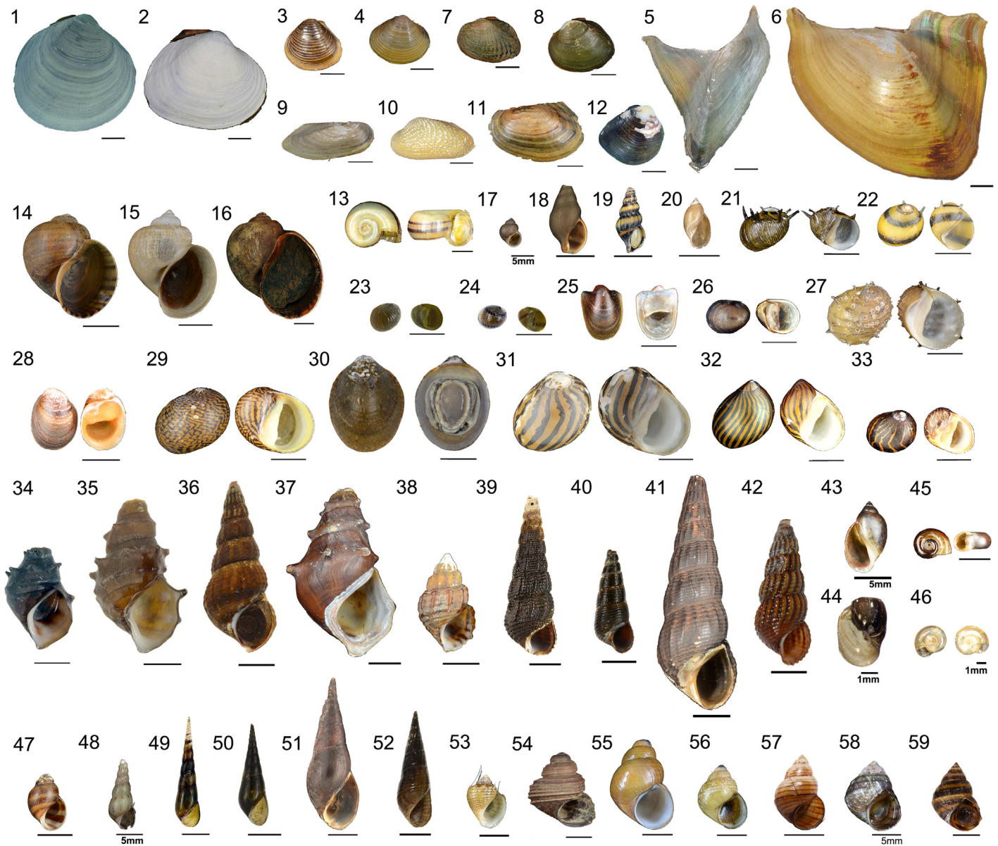
Fig 1. Freshwater molluscs in the ornamental pet trade. Unless indicated differently, scale bars = 10mm. 1. Batissa similis ; 2. Batissa violacea ; 3. Corbicula fluminea ; 4. Corbicula moltkiana ; 5. Hyriopsis bialata ; 6. Hyriopsis desowitzi ; 7. Parreysia burmana ; 8. Parreysia tavoyensis ; 9. Pilsbryconcha exilis ; 10. Scabies crispata ; 11. Sinanodonta woodiana ; 12. Unionetta fabagina ; 13. Marisa cornuarietis ; 14. Pomacea canaliculata ; 15. Pomacea diffusa ; 16. Pomacea maculata (photograph by K.A. Hayes); 17. Bithynia sp.; 18. Clea bockii ; 19. Clea helena ; 20. Radix rubiginosa ; 21. Clithon corona ; 22. Clithon diadema ; 23. Clithon lentiginosum ; 24. Clithon mertoniiana ; 25. Neripteron auriculata ; 26. Neritina iris ; 27. Neritina juttingae ; 28. Neritina violacea ; 29. Neritodryas comea ; 30. Septaria porcellana ; 31. Vittina coromandeliana ; 32. Vittina turrita ; 33. Vittina waigiensis ; 34. Brotia armata ; 35. Brotia binodosa ; 36. Brotia herculea ; 37. Brotia pagodula ; 38. Sulcospira tonkiniana ; 39. Tylomelania towutica ; 40. Tylomelania sp.; 41. Tylomelania sp.; 42. Tylomelania sp.; 43. Physa sp.; 44. Amerianna carinata ; 45. Indoplanorbis exustus ; 46. Gyraulus convexiusculus ; 47. Semisulcospira sp.; 48. Melanoides tuberculata ; 49. Stenomelania offachiensis ; 50. Stenomelania plicaria ; 51. Stenomelania cf. plicaria ; 52. Stenomelania sp.; 53. Thiara cancellata ; 54. Celetaia persculpta ; 55. Filopaludina cambodjensis ; 56. Filopaludina peninsularis ; 57. Filopaludina polygramma ; 58. Sinotaia guangdongensis ; 59. Taia pseudoshanensis .