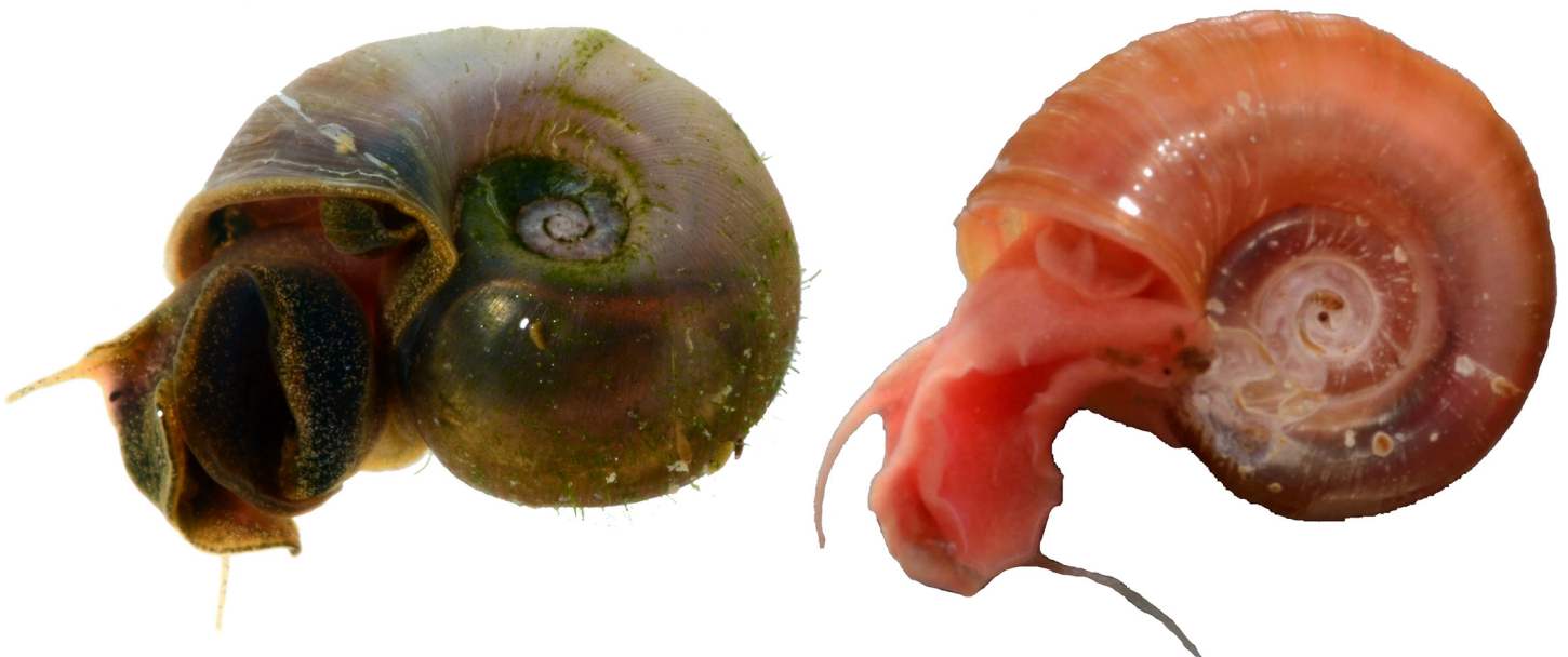
Fig 3. Two morphs of Indoplanorbis exustus in the aquarium trade.

DNA barcodes work well when the chosen molecular markers are sufficiently diagnostic to delimit species [111] and the species taxonomy of species is well resolved [111]; most species in our study satisfied these conditions. Some exceptions, however, were closely-related, sympatric species ( Tylomelania spp., Brotia armata , Brotia binodosa ) that failed to have diagnostic barcodes, possibly due to either recent speciation or to introgression [63]. Our study also included species with poorly understood species boundaries; a good example is in the case of three Stenomelania spp. in the trade which belong to the Stenomelania plicaria species complex ([112], M. Glaubrecht pers. comm.). DNA barcodes can here suggest species boundaries, but they