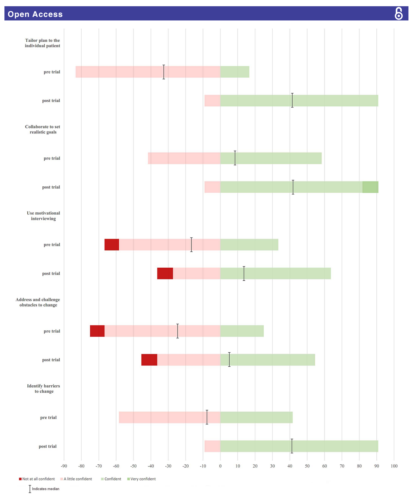
Figure 3 Survey results for general practitioners (GPs) pre and postpilot study relating to GP efficacy expectations in the 'Assist' and 'Arrange' categories of the 5As framework. Light red, a little confident; dark red, not at all confident; light green, confident; dark green, very confident. Black line indicates the median value.

people are actually relieved and grateful when you do that for them. And I guess before I thought they would be more embarrassed or upset, when they're not, that's what they want. They talk to me about it. (GP-SP)