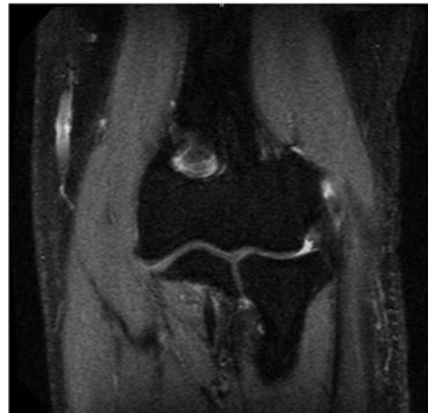
Figure 2. A coronal fat-suppressed T2-weighted pre-treatment MRI showing a partial rupture of the extensor carpi radialis brevis (ECRB) tendon and a plica humero-radialis without impingement in Patient 5.

preparations. 15,20 This feature might be even more important when administering ACP+rhCollagen, since the combined fluid is more viscous than pure ACP, thus requiring large-bore, i.e. , more painful, needles. Further, the potential of the combined ACP+rhCollagen-injection to foster complete healing via a single injection offers another major advantage compared with other non-surgical LEP treatments, such as steroid injections for instance: although still popular in the treatment of multiple degenerative and tendon-related orthopaedic conditions in general and LEP in specific, steroid injections are only short-term effective (approximately 4wks) and even associated with adverse long-term effects (>6wks), such as decreased tenocyte replication and collagen production as well as increased risk of tendon rupture, 1 especially after repeated injections. Although still little is known about the long-term effects of