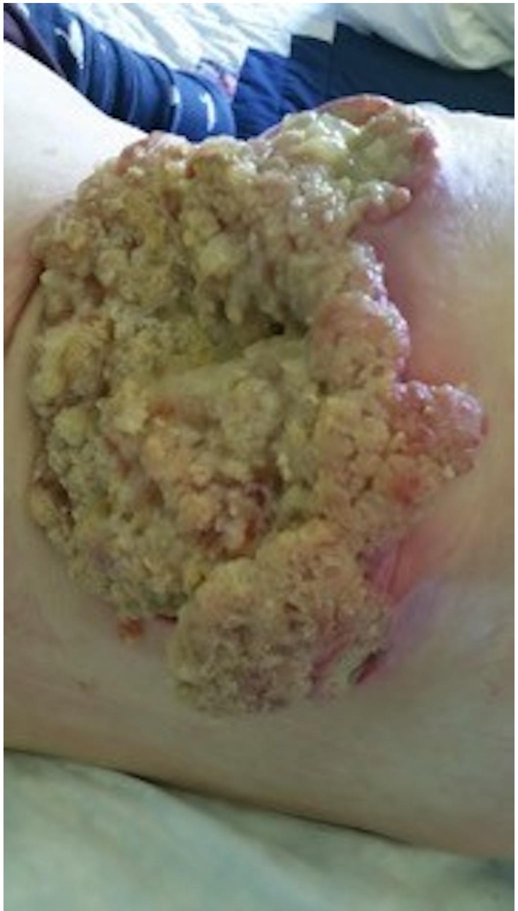
FIGURE 5: Protruding right flank mass eight weeks following