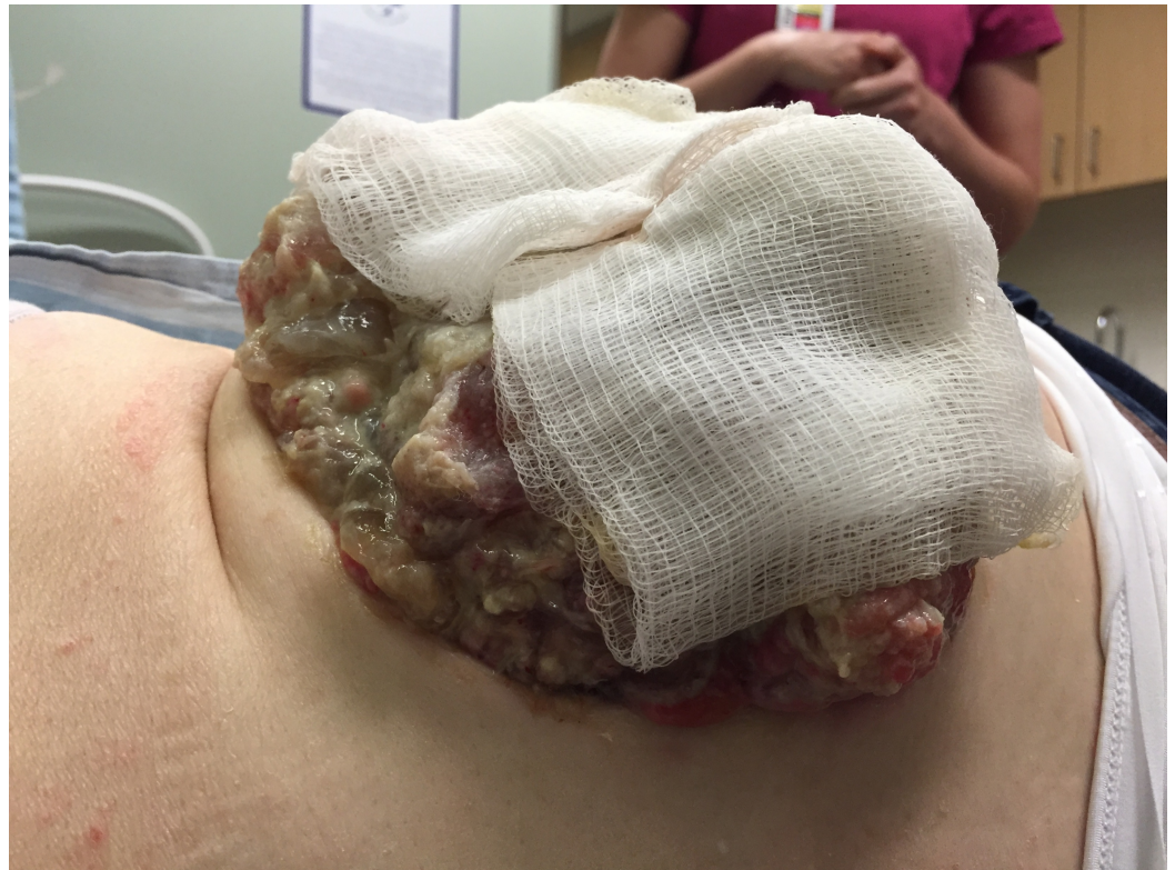
FIGURE 2: Bandages soaked with mucin