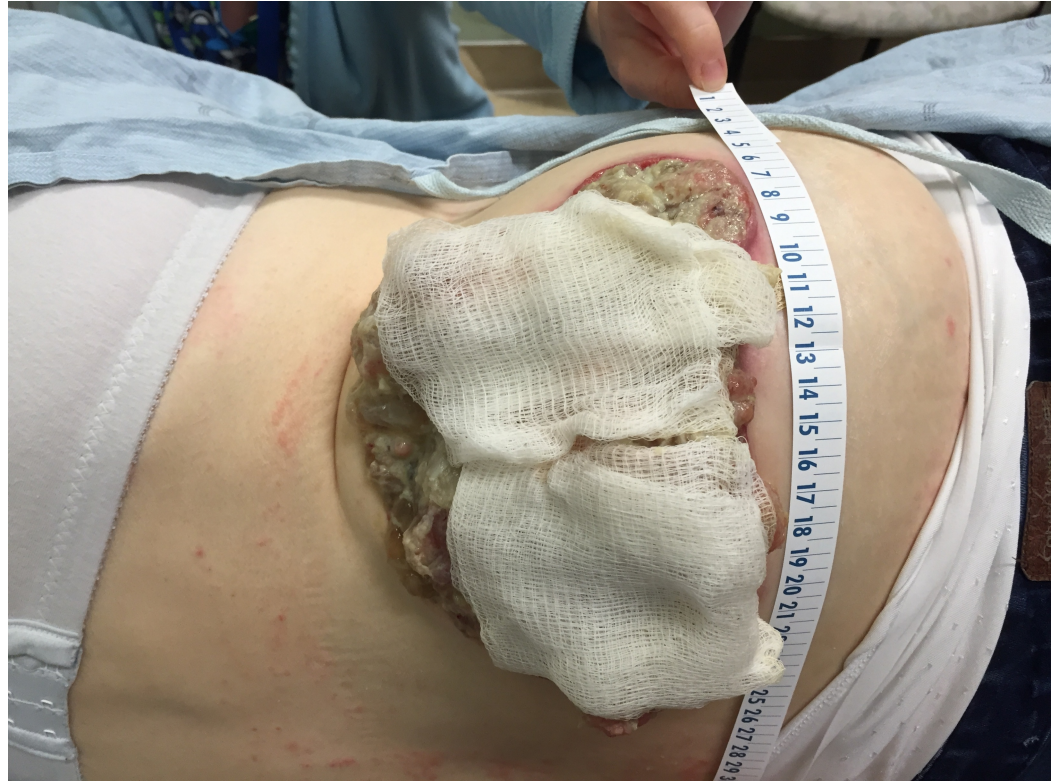
FIGURE 1: Protruding mucin-weeping mass, right posterior flank

Mucin was oozing in quantities that required several sessions daily, where she would wash off the excess with a shower head and apply new absorbent dressings, which were becoming expensive. Nausea was also bothersome because of slowed gastrointestinal motility and opioids. Her Eastern Cooperative Oncology Group (ECOG) performance status was three. On examination, the visible component of the mass measured approximately 24 x 14 cm at its base and extended between 7 and 9 cm from the skin surface (Figures 1-2). A CT measured the confluent intra-abdominal component of the mass at 13 x 12 x 9.5 cm (Figure 3). Numerous other deposits and mucin filled the rest of the abdominopelvic cavity.