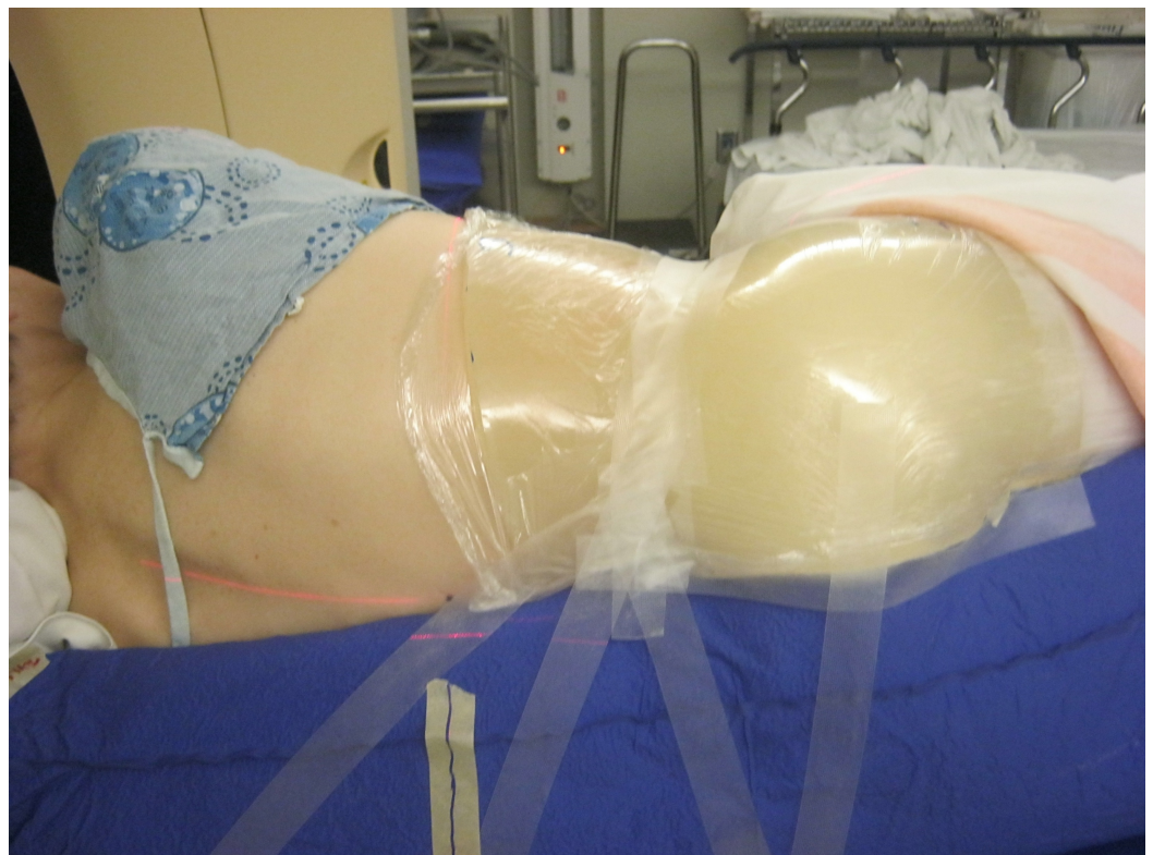
FIGURE 4: Radiation therapy simulation set-up with patient lying on her uninvolved side within a full-body vac-lock bag with a 1 cm bolus over bandaged, protruding mass

reducing the volume of mucin oozing from the mass to improve tumor hygiene, decrease the frequency of dressing changes, and improve her quality of life. Pain relief was a secondary goal. She underwent CT simulation lying on her uninvolved side, supported by a full-body vac-lock bag for immobilization. One cm of tissue-equivalent bolus was applied over the bandaged protruding mass [Figure 4]. Treatment was administered with 6 MV photons via volumetric modulated arc therapy (VMAT) to minimize GI toxicity. The gross tumor volume (GTV) included all disease seen on imaging and clinical examination. The clinical target volume (CTV) was a 1-cm isotropic expansion from the GTV, excluding uninvolved muscle, viscera, and bone. The planning target volume (PTV) was a 1-cm isotropic expansion from the CTV. Cone beam imaging was used to verify patient positioning. She was administered an 8 mg orally disintegrating tablet of ondansetron before each fraction for radiation therapy-induced nausea and vomiting (RINV) prophylaxis and instructed to take the same medication for two days after each fraction. She was given 2 mg of hydromorphone subcutaneously for incident pain moving on and off the treatment couch. She tolerated treatment relatively well despite her incident pain.