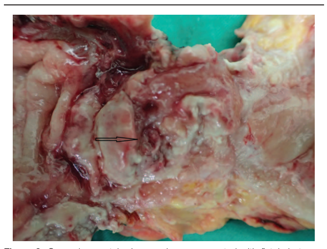
Figure 2. Secondary rectal adenocarcinoma presented with fistula between rectum and urinary bladder (arrow), no typical gross ulcerated tumor.