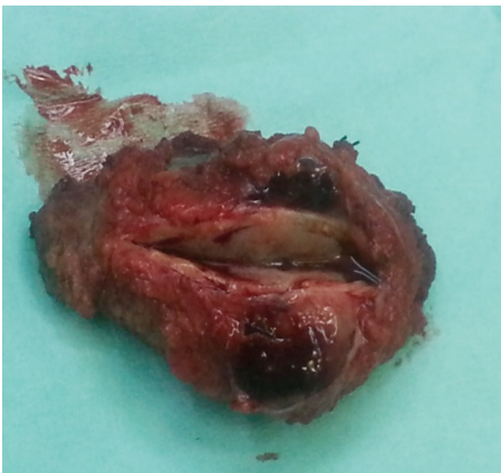
FIGURE 2: Macroscopic appearance of the metastases from bladder cancer to left sartorius muscle.

performed. Macroscopically, it was an 8 \times 4 \times 4 cm lesion with smooth margins and the cross-section was white and shiny (Figures 1 and 2). The postoperative period was uneventful. The pathology of the lesion reported a 9 \times 4 \times 3,9 cm skeletal muscle with a solid lesion of a maximal diameter of 7,2 cm. The skeletal muscle was infiltrated from a malignant lesion compatible with a high grade urothelial carcinoma positive to the CK7 marker and negative to the CK20 (Figure 3). The marker of cellular proliferation Ki67 was 40% positive. The patient subsequently received systematic chemotherapy with gemcitabine and cisplatin (6 cycles) and was subjected to radiotherapy at the site of the excision of the skeletal muscle metastasis and that of the cystectomy. The patient 7 months after the excision of the muscle metastasis in the left thigh is still alive and with a good performance status with a negative imaging follow-up.