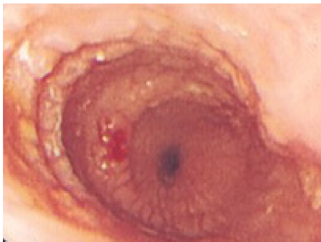
Fig. 1. Endoscopic image of the esophagus performed at 3 years of age, demonstrating concentric rings and nodularity in the mid and distal esophagus, and easy contact bleeding.

An upper gastrointestinal endoscopy was performed at 18 months when an attempt to stop PPI therapy resulted in