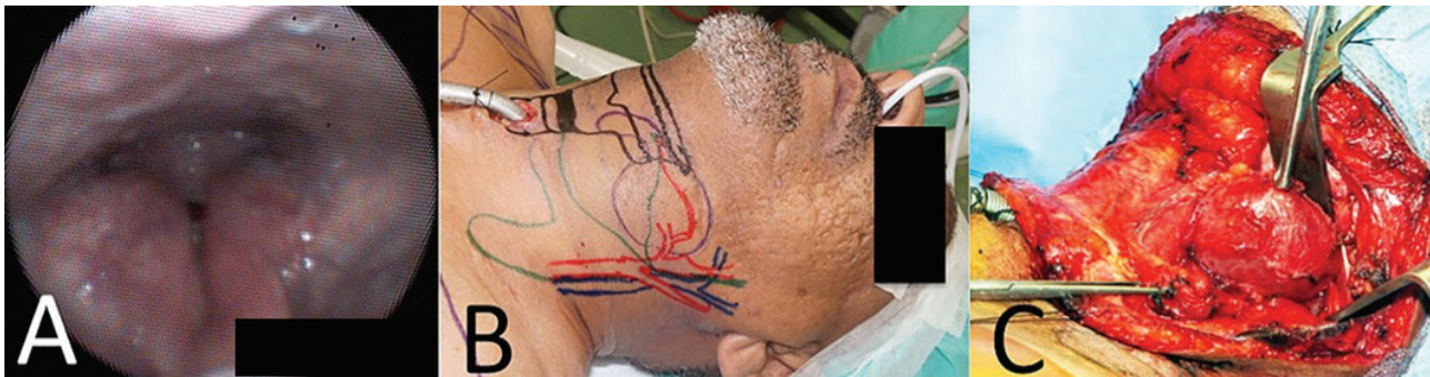
Figure 1 - Clinical photos showing the A) preoperative laryngoscopy showed significant airway compromise, B) preoperative planning, and C) intraoperative exposure of left laryngocele.

V-shaped thyrotomy to improve exposure (Figure 2). No malignancy was identified in the final pathology.