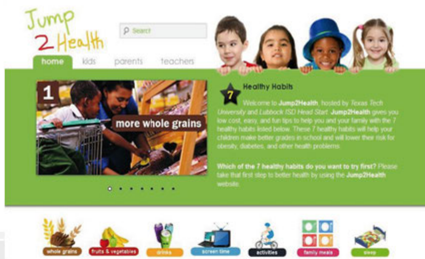
Figure 2. Sample Webpage from the Jump2Health Website™ Developed from Phase I Focus Group Discussions with Head Start Parents and Teachers.