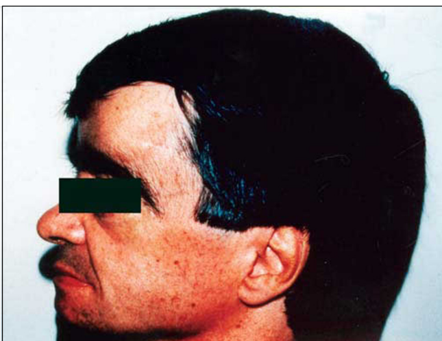
Photo 2. Case 2: patient aged 48 years, male, with progressive osteopetrosis. Note anterior-posterior widening of skull.