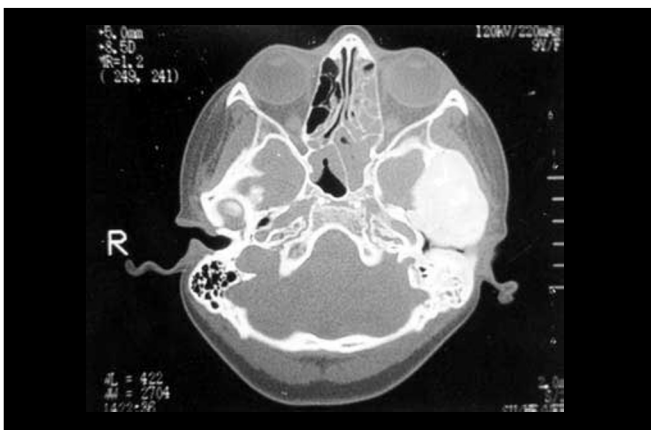
Photo 5. Temporal bone CT scan (axial section) of a patient with fibrous dysplasia of temporal bone on the left, as differential diagnosis. Note the spongiotic bone.

addition to impairment of facial nerve canal. The presence of exaggerated increase of bone with rarefaction of medullary cavity supports diagnosis 2 . In the patient affected by Camurati-Engelmann disease, initial symptom related to temporal bone affection was slowly progressive hearing loss. What attracted our attention and made the patient come for medical care was facial palsy, which evolved to bilateral presentation within one month, considering that there was delay between the first manifestations of facial nerve involvement and the first visit (2 months), which worsens prognosis when it comes to compression the nerve or narrowing of canal. The first manifestations of the disease are normally in long bones, but we should be attentive to the possibility of having temporal bone affection so that treatment can be started as early as possible.