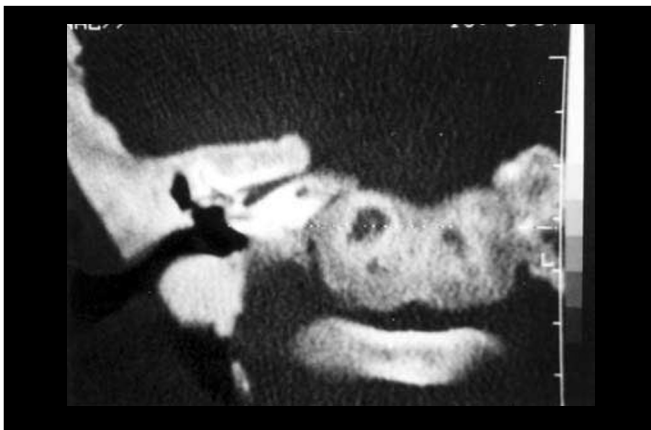
Photo 4. Case 3: Temporal bone CT scan (coronal section) in patient with Camurati-Engelmann disease, evidencing impairment of temporal bone, bone compression of internal acoustic canal on the right.