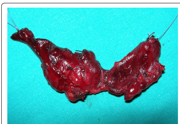
Figure 6 Total thyroidectomy for a MEN 2B patient 3 years old. Macroscopic evidence of carcinoma in the right lobe. Homolateral lymphadenectomy together with central compartment lymphadenectomy has to be performed during thyroidectomy.

Resected thyroids have to be weighed, measured, fixed in formalin and divided in three parts, namely right and left lobe, and hysthmus. Each part is divided by transverse