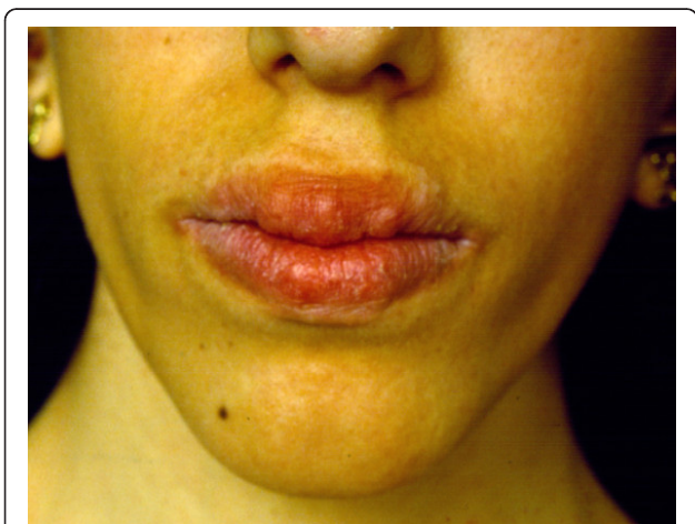
Figure 1 Characteristic phenotype of MEN 2B including thickened lips with bumps.

Unfortunately, at time of diagnosis most of the sporadic MEN 2B patients present a palpable thyroid mass or thyroid nodules, all representing MTCs. As a matter of fact, MEN 2B is the least common (5-10% of all MEN), but the most aggressive form of MEN 2. Patients have a rapid onset of MTCs during the first year of life, and they have a more aggressive form of carcinoma with higher