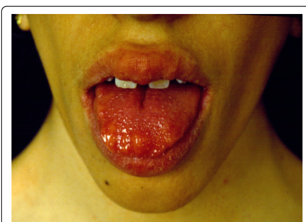
Figure 2 Multiple pseudo-polyps and bumps on the tongue. The lesions are mucous ganglioneurofibromas and ganglioneuromas.