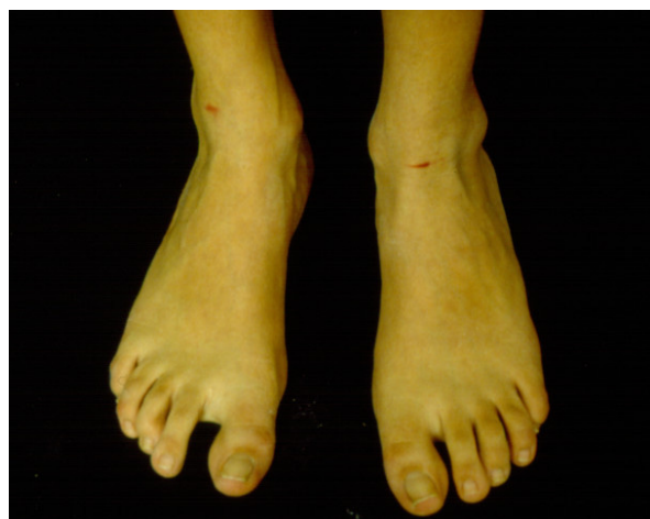
Figure 3 The first toe is longer than the others and there is a wide space between the first and second toe.

morbidity and mortality rates compared with patients with MEN 2A. Lymph node metastases are reported by the second year of life [4,26].