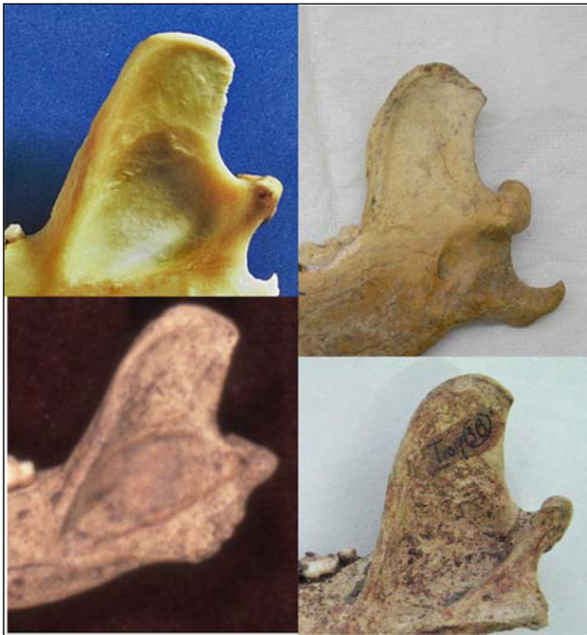
Figure 2. Coronoid process (mandible) profiles, clockwise from bottom left. Thule-age dog (<1000 years old) from Devon Island, central Canadian Arctic [17]; modern Alaskan malamute (Univ. Victoria, Canada 90/28); Razboinichya canid; and Neolithic Chinese dog from Jiahu site [31]. Many Neolithic dogs from the Middle East and North American wolves [32] have a straight profile like Arctic Thule-aged dogs illustrated on the left, while dingo and Chinese wolves [33] have the slightly hooked profile shown on the right. Prehistoric North American dogs outside the Arctic [32,33] have a profile with a more pronounced hook than the Razboinichya and Jiahu specimens above. doi:10.1371/journal.pone.0022821.g002