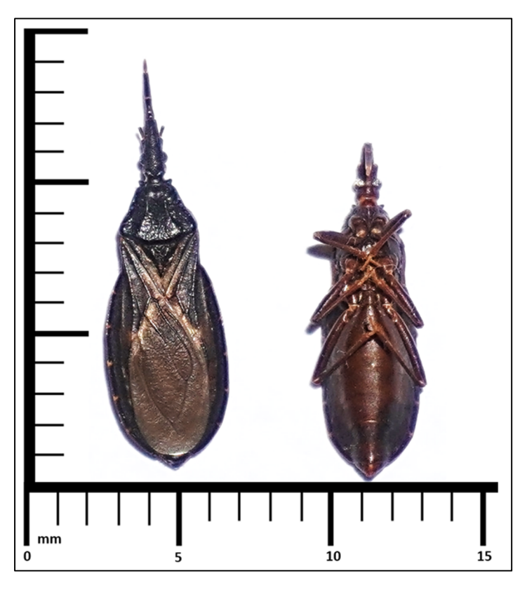
Figure 2. Dorsal ( left ) and ventral ( right ) views of adult female Triatoma protracta (Uhler) collected from home in Mendocino County, CA, USA.