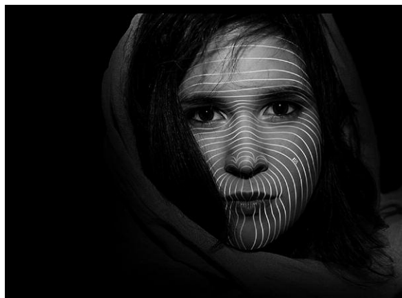
Figure 3. Relaxed skin tension lines also described as Borges lines

Biomechanical parameters of the skin alter in the course of human life. During the process of ageing the skin be-