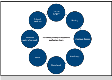
Multidisciplinary team to treat injection drug userelated endocarditis.

https://doi.org/10.1016/j.xjon.2021.05.021