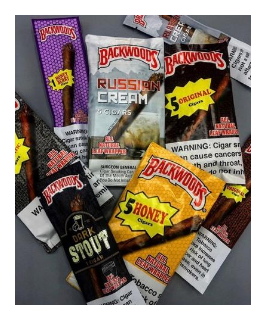
Figure 1. Backwoods cigar packaging.

Backwoods (Figure 1), a machine-manufactured, mass-merchandised cigar brand (Imperial Tobacco Group [ITG] Brands LLC-the third largest tobacco company in the U.S.) with a rising market share. Backwoods uses words and phrases like "natural" and "always true" in its advertising claims and product packaging [11]. Backwoods' brand-specific flavors (e.g., black n' sweet aromatic, dark stout, Russian creme) may appeal to consumers while claims about "natural cigars" on the company's website [11] may mislead consumers into perceiving that Backwoods offers a reduced risk tobacco product.