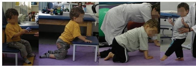
Fig. 2 Post-intervention results: (A) While sitting on the low stool, the patient maintained trunk control performing uni- or bimanual object handling; (B) Patient can transfer from the sitting to the kneeling position using a low stool support; (C) Patient remains on all fours and performs decoupling of limbs; (D) In the standing position, patient walks with the therapist's support

The child began to handle small and large objects with better coordination and handgrip, which helped improve his daily activities and playing, according to the mother. This improvement in movement control was demonstrated by the GMFM, as positions requiring control or weight bearing on hands and UL were achieved.