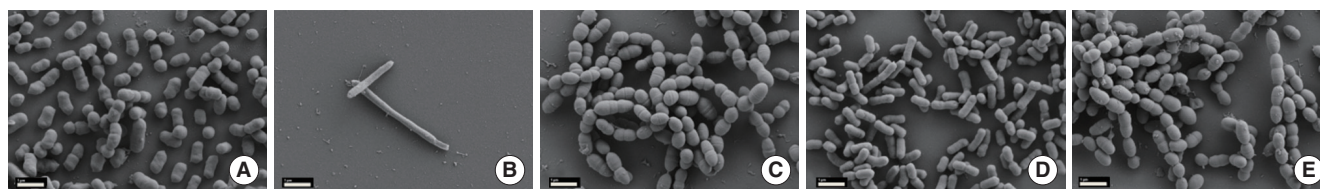
Figure 3. Representative scanning electron microscopy images of the biofilms after 24 hours ( \times 30,000 ): (A) Porphyromonas gingivalis , (B) Fusobacterium nucleatum , (C) Streptococcus gordonii , (D) Aggregatibacter actinomycetemcomitans , and (E) multispecies bacteria. Bars = 1 \mu\text{m} .