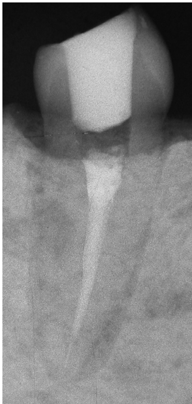
Fig. 1. Evaluation of the tooth # 205 (pre-molar; 1 canal; manual instrumentation). Length = 0; Density = 0; Taper = 0 → Overall score = 0.