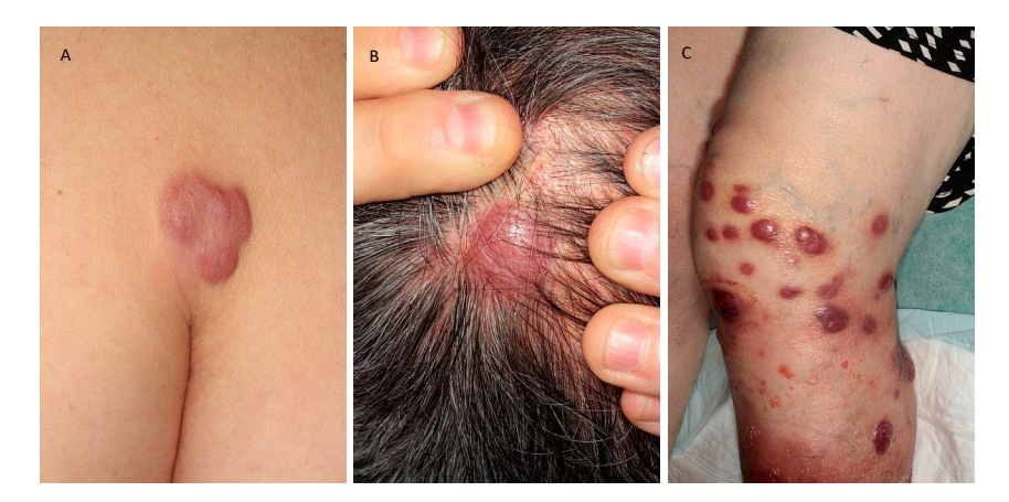
Figure 1. Clinical presentations of the three main subsets of primary cutaneous B-cell lymphomas.(A) Primary cutaneous marginal zone lymphoma; (B) primary cutaneous follicle center lymphoma;(C) primary cutaneous diffuse large B-cell lymphoma.

PCMZL usually presents with erythematous to violaceous papules, plaques, nodules or tumors (Figure 1A), sometimes infiltrated but ulceration is atypical. Peri-lesional annular or diffuse erythema is possible [8]. Solitary or multifocal, the lesions are localized preferentially on the trunk or the upper extremities. The lesions can regress spontaneously and rarely give way to anetoderma [9]. PCMZL manifesting as AL amyloidoma of the skin, without systemic amyloidosis, has also been reported [10]. Cutaneous relapses occur in half of the cases but extracutaneous spread is very uncommon [11], as well as transformation to high-grade lymphoma [12].