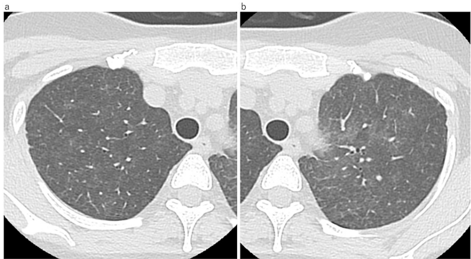
FIGURE 2: High-resolution computed tomography (HRCT) of Case 2 on admission

a,b: HRCT showing slight bilateral diffuse ground-glass opacity.