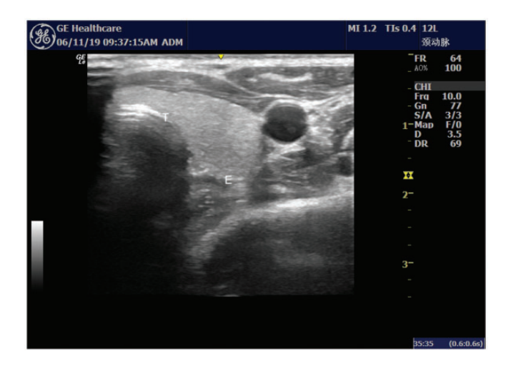
Figure 1. Tracheal ultrasonography reveals the trachea and esophagus. T, trachea; E, esophagus.