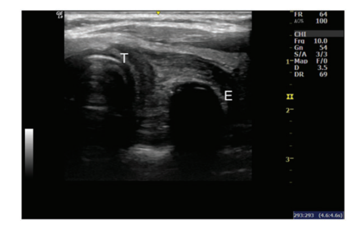
Figure 2. Esophageal intubation. A dilated esophagus and esophageal "double-track sign" were observed. T, trachea; E, esophagus.

ultrasonography study group members immediately discontinued the procedure. During the procedure, we tried to ensure that the ultrasonography study group members and the fiberoptic bronchoscope operators were unaware of the ETT position. If the fiberoptic bronchoscopy confirmed that the ETT was in the esophagus, endotracheal intubation guided by