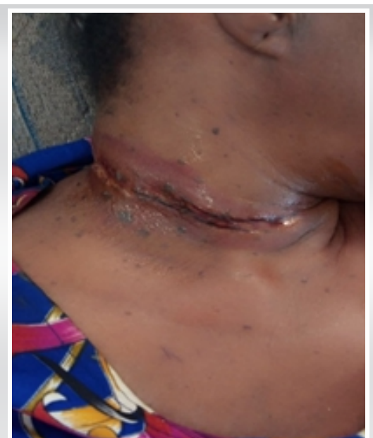
Figure 5: Circumferential neck bruise "veil sign."