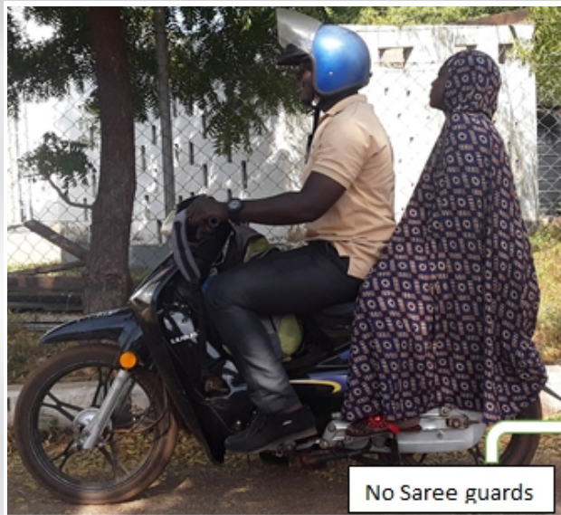
Figure 1: A pillion motorbike rider wearing a long veil hanging loosely, rear spokes have no saree guards.