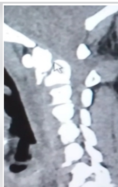
Figure 3: Odontoid fracture with cord compression.

A 22-year-old female was riding a motorbike without a helmet when her veil got entangled in the wheel of the bike. She fell on the ground and landed on the neck. On examination, she was hemodynamically stable. Her Glasgow coma score (GCS) = 14/15, and power of 2/5 in upper limbs and 0/5 in lower limbs with sensory level at T4. Rectal sphincter tone was lax. She had a