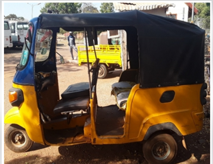
Figure 2: An auto rickshaw.