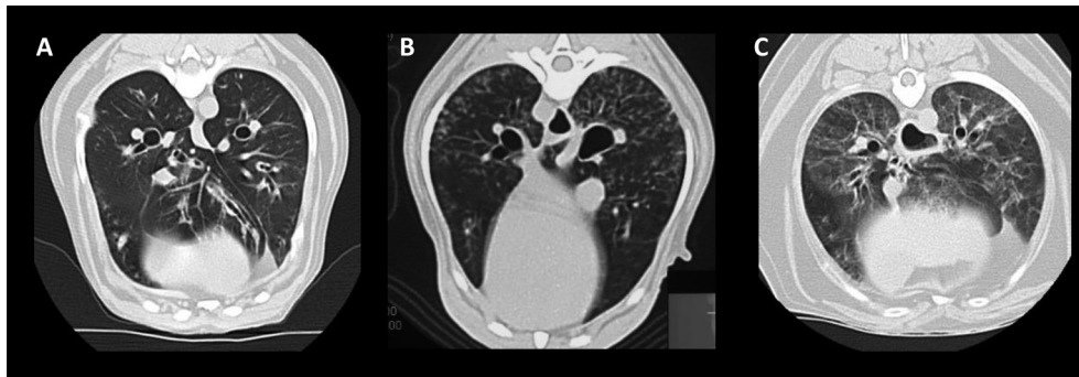
Fig. 1. Examples of three lung patterns on CT imaging. A: bronchial pattern in chronic bronchitis; B: interstitial pattern by diffuse granular shadows in diffuse panbronchiolitis; C: interstitial pattern by ground glass opacity with septal thickening in idiopathic pulmonary fibrosis.

a two-site sandwich ELISA were used. A standard curve was prepared using purified cSP-A [8, 13] from stocked BALF samples of clinically healthy dogs, which were used in a previous study [22]. In preliminary examination, this assay showed the detection limited of 3.1 ng/ml and the coefficient of variation of 1.28–8.92%. Furthermore, BALF and serum cSP-A concentrations in healthy adult dogs were 2,033 \pm 1,214 ng/ml and 23 \pm 13 ng/ml. In addition, BALF cSP-A concentrations were corrected by urea concentrations (QuantiChrom™ Urea Assay Kit, BioAssay Systems, Hayward, CA, U.S.A.) in serum and BALF [17].