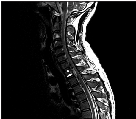
Fig. 1. Magnetic resonance imaging reveals a large acute spinal subarachnoid hematoma extending from C2 to T4 with spinal cord compression and numerous dilated anterior spinal arteries at the C6–T3 levels (white asterisk).

The patient underwent aortobifemoral bypass surgery performed by a vascular surgeon. However, he died 2 days later as a result of multiple organ failure caused by compartment syndrome.