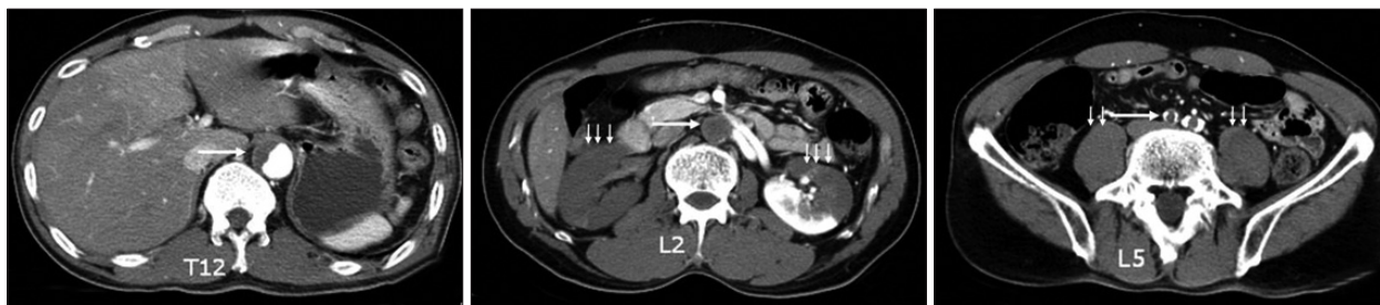
Fig. 5. The axial computed tomography angiography of the abdominal aorta and lower extremities reveal aortoiliac thrombotic occlusion (large arrow) and renal infarction (small arrows).

tential that is a suitable primary imaging method for patients with spontaneous paraparesis. However, MRI images cannot reliably identify the blood/arachnoid interface when they are in close proximity. Moreover, as in cases of ventral hematoma, it is not possible to determine whether the hematoma is located in the epidural, subdural, and subarachnoid space.