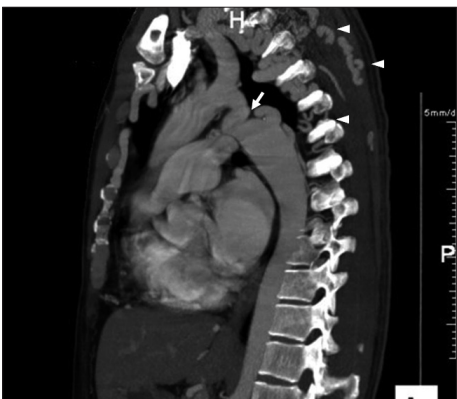
Fig. 2. The computed tomography angiogram reveals a tortuous aortic coarctation (white arrow) with an extensive network of collaterals (arrowheads).