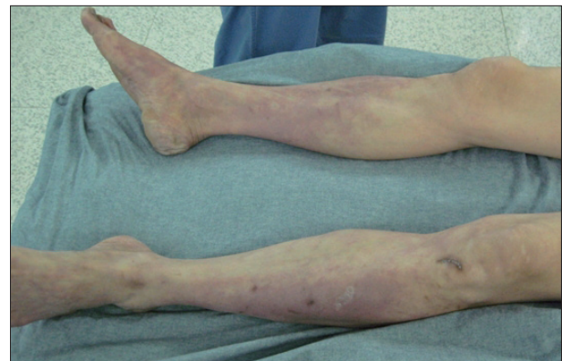
Fig. 4. The patient exhibited pallor and livedo reticularis in his lower extremities.