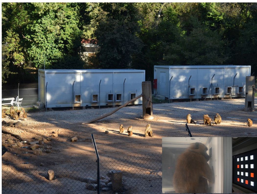
Figure 5 Guinea baboons with RFID chips to automate individual identification of responses in touchscreen booths at the CNRS Primate Center in Rousset-sur-Arc, France. Inset shows a baboon inside one of the touchscreen booths.

of the same species (e.g., as is typical of primate sanctuaries or National Primate Research Centers). Lastly, although numbers may be small at a single institution, research in zoos where collaboration between institutions is often already in the culture may be a feasible route to obtaining data from several groups and species (e.g., Dean et al., 2011 ; Cronin, 2017 ). Researchers would need to consider variation introduced from multiple sites, but would likely increase their statistical power and the generalizability of their findings.