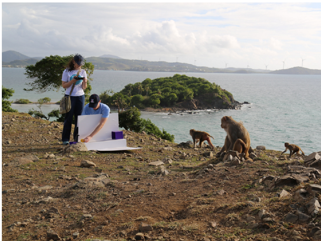
Figure 4 A portable experimental setup for testing rhesus macaque cognition at the Cayo Santiago Field Station, Puerto Rico.

subjects. They designed an apparatus that subjects could control at the perimeter of their enclosure and compared changes in the proportion of food-sharing attempts made by individuals when different food distributions were possible. By employing a within-subjects design, it was not necessary to obtain the same number of trials across all individuals or conditions (see also Finestone et al., 2014 ; Molesti & Majolo, 2016 ). Other dynamic aspects of the testing environment, such as the order of exposure, amount of previous experience with the task, or the current social composition, can now be handled statistically through the use of generalized mixed effects models when sample sizes are sufficient (see Crockford et al., 2012 ; House et al., 2014 ). Those studying social relationships or social learning may actively wish to test within-group dynamics using social network analyses ( Whitehead, 2008 ), network-based diffusion analysis ( Franz & Nunn, 2009 ; Franz & Nunn, 2010 ) or option-bias analysis ( Kendal et al., 2010 ; Kendal et al., 2015 ). Mixed effects models are useful for handling datasets in which the same individuals are tested in different social configurations, and they can also handle non-factorial designs that may be prevalent in experiments that rely on opportunistic data collection in a captive or wild setting.