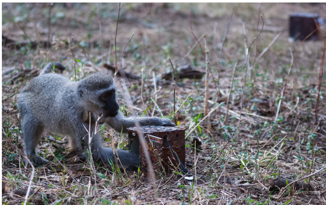
Figure 3 Vervet monkey accessing one of several available apparatuses at Inkawu Vervet Project, South Africa.

to the test apparatus after more dominant group members become satiated. For example, Hopper et al. (2007) presented a tool-use task to captive chimpanzees ( Pan troglodytes ) in 5-hour long sessions, obtaining data from 79% of the chimpanzees in two captive groups. Our fourth suggestion comes from a new cognitive testing paradigm used with a group of zoo-housed Japanese macaques ( M. fuscata ), where the whole social group has access to touchscreens in two test booths at the periphery of their habitat when a researcher is present ( Cronin, Hopper & Ross, 2015 ). The macaques were trained to recognize an ‘end-of-session’ cue that indicates they will not receive any additional rewards for the day, causing them to leave the testing booth and allowing untested individuals to participate. This has proven an effective way to obtain touchscreen trials from lower ranking individuals who participate once the higher-ranking ones have disengaged after receiving their end-of-session cue.