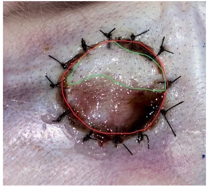
Fig. 2. Composite graft treatment viability.

Composite graft was assessed for its viability based on macroscopic observations, the non-viable tissue was described by the presence of necrotic, darker color accompanied by dry tissue, such as tanning in the red marker areas in Fig. 2, while the viable graft fingers were not visible as green areas.