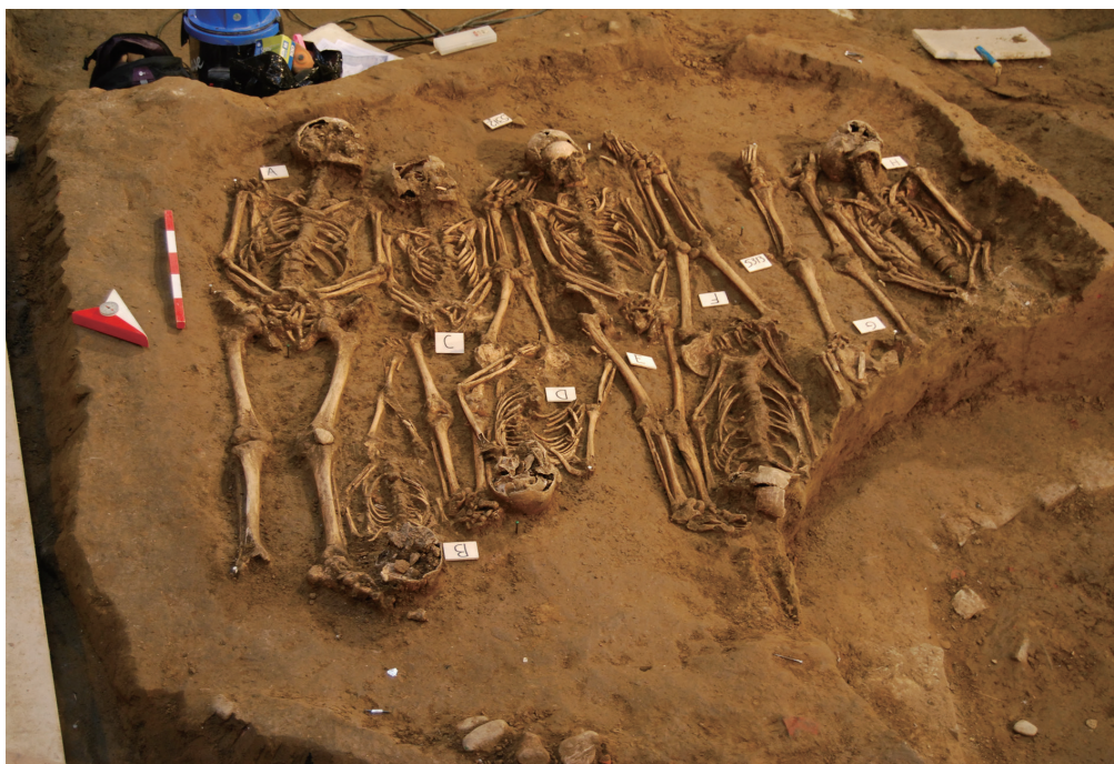
Fig. 1. Pit grave T9 (Uffizi Gallery, Florence) containing 8 aligned individuals deposited simultaneously. The bodies were closely joined, with alternating orientation and diversified position of the upper limbs.