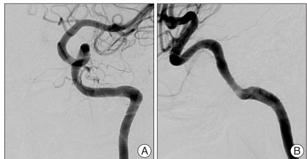
Fig. 3. AP (A) and lateral (B) views of 3-month angiography demonstrate anatomic reconstruction of the parent artery with complete occlusion of the aneurysm with the meningohypophyseal trunk preserved.

approved the PED for the treatment of large or giant wide-necked intracranial aneurysms for petrous to superior hypophyseal segments of the ICA 27 . More recent reports on postmarket data, and results of mid-, and long-term follow-up have supported these results 9,19,21 .