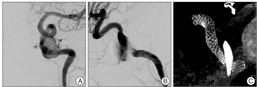
Fig. 2. Immediate postprocedural angiography with AP (A) and lateral (B) views show that filling of the aneurysmal sac is slower than preprocedural angiography. DynaCT (C) shows stagnation of the contrast within the sac and good position with no redundant portions or stenosis of the device.